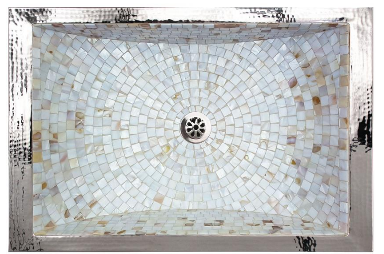
V016 PN-A-18-D004 PN Shown