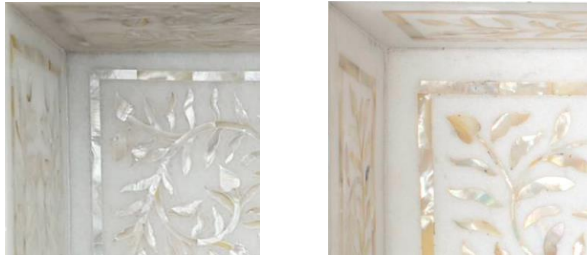
Mother of Pearl color will vary from sink-to-sink