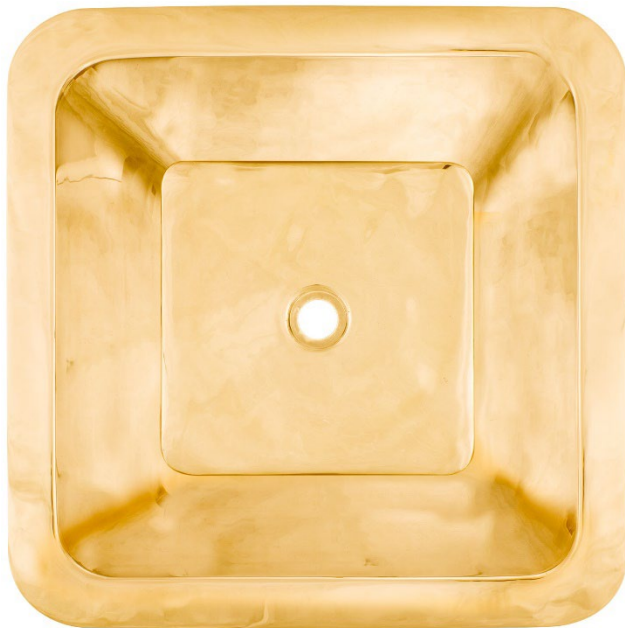
Shown in PB

Linkasink warranties our product to be free from manufacturing defect for the life of the product. Warranty does not cover improper care, neglect, abuse, or normal wear-and-tear.