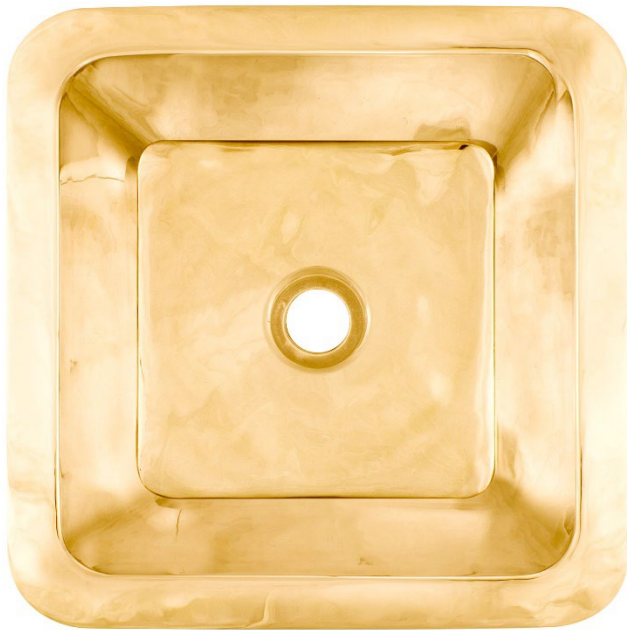
Shown in PB

Linkasink warranties our product to be free from manufacturing defect for the life of the product. Warranty does not cover improper care, neglect, abuse, or normal wear-and-tear.