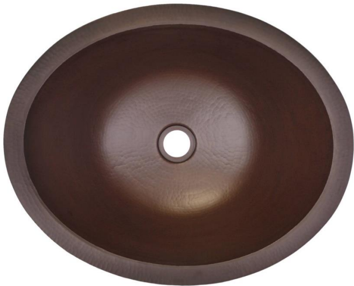
Shown in Dark Bronze (finishes may vary)