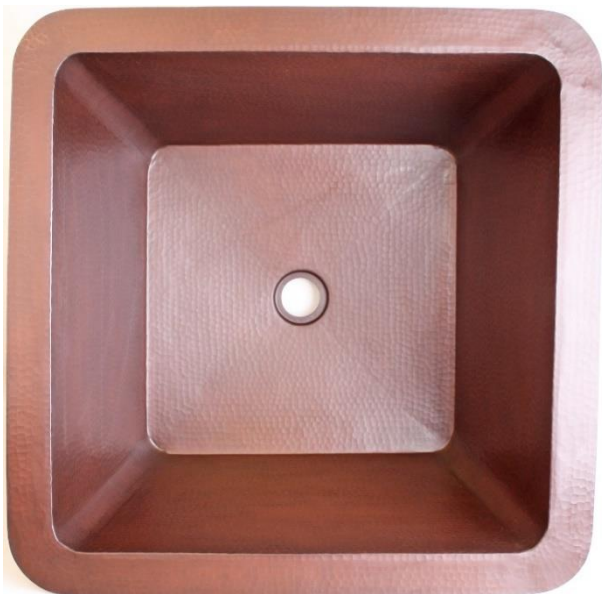
SHOWN IN WEATHERED COPPER (Finish may vary)