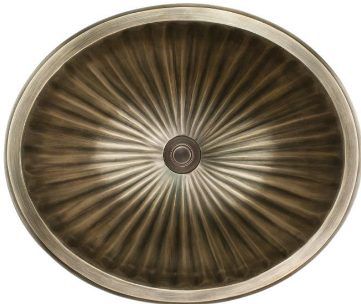
SHOWN IN AB