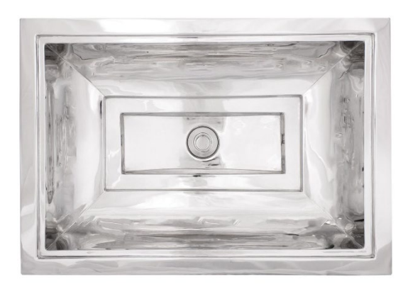
Shown in PS