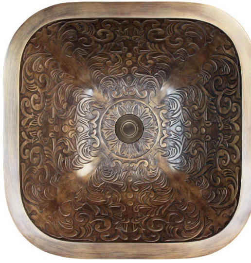
Shown in AB