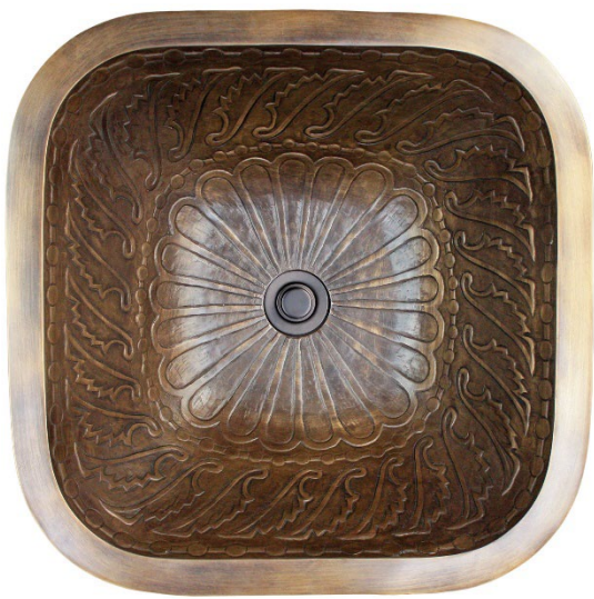
Shown in AB

Linkasink warranties our product to be free from manufacturing defect for the life of the product. Warranty does not cover improper care, neglect or abuse or normal wear-and-tear