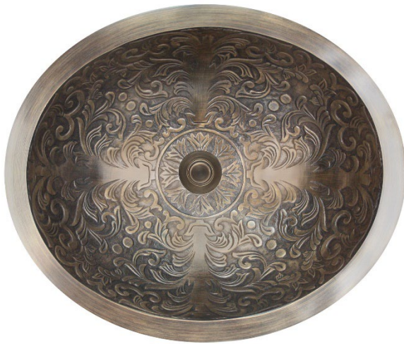
Shown in AB

Linkasink warranties our product to be free from manufacturing defect for the life of the product. Warranty does not cover improper care, neglect or abuse or normal wear-and-tear