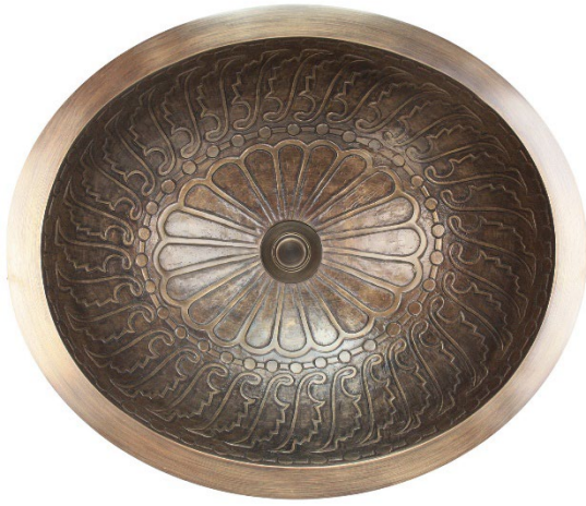
Shown in AB