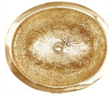
Shown in WB