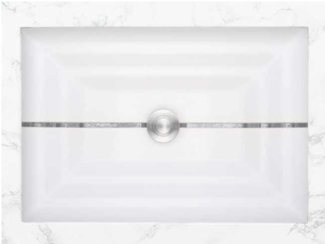
AG01B-01SLV shown above

See our "Artisan Glass Fact Sheet" for additional details.